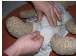
Fasten sides securely with a snappi, if desired