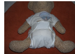
Put cover on over diaper, folding down top portion if necessary