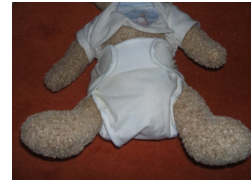
Secure cover over diaper

◆ Always make sure all of the diaper is inside the cover. Any overflow will cause leaking.