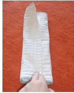
Fold both sides in