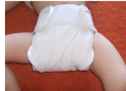
Lift the cover up over the diaper and fasten the Velcro closures.