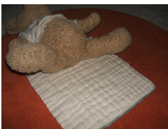
Place baby on flat diaper