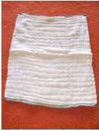
Lay diaper flat