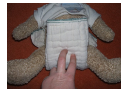
Bring bottom of diaper up.