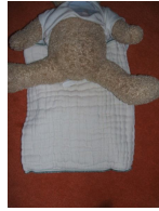
Place baby on diaper