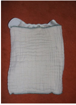
Lay diaper in cover