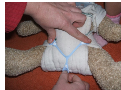
Pull the center "claw" down tightly and secure to diaper