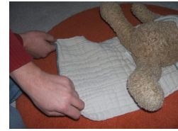
Crossing arms hold corners of diaper