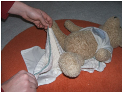
Uncross arms and bring front of diaper up, forming a crossed center portion