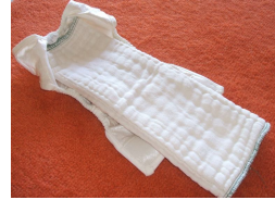
Turn folded diaper over and place in cover. Make sure the back and sides of diaper are pressed under the elastic of the cover.