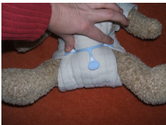
Bring each side of the back of the diaper up and fasten with snappi